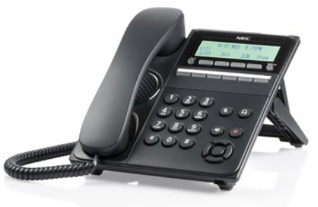
DT920S 6 button phone with greyscale display